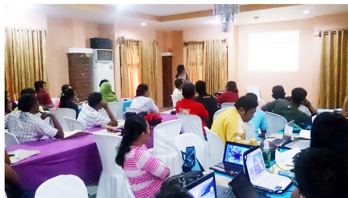
Participants listen attentively during the Seminar of the Application of BGPMS and Writeshop on SBGR

Held in Koronadal City at the Splash Del Rio and Aqua Frio Resort, respectively, the activity was conducted in four (4) batches to accommodate