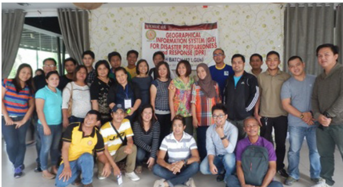
Participants pose for a Group Photo following the Successful Capacity Building Activity on GIS for Disaster Preparedness and Response

DILG 12 recently carried out the last two (2) batches of the training on Geographic Information System (GIS) for Disaster Preparedness and Response (DPR) at the Sarangani Highlands and Venue 88 both in General Santos City, respectively.