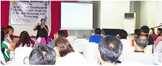
Participants during one of the lectures conducted at the GAD Focal Point System Activity

The Members of the Gender and Development (GAD) Focal Point System from General Santos City, City of Koronadal and Municipalities of Sto. Niño, Lake Sebu, Surallah, Norala, T'boli, Tampakan, Tantangan, Banga, Tupi, Polomolok actively participated during the training and workshop on GAD Gender Analysis, GAD Planning and Budgeting at Phela Grande Hotel, General Santos City recently.