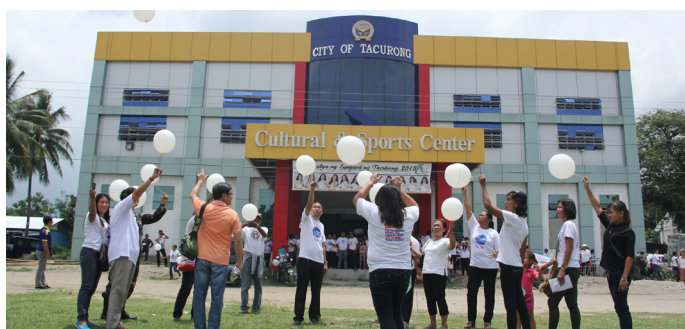
Some Tacurong constituents during one of the ceremonies conducted at the I VOTE GOOD Campaign launching

I matter, my vote matters – this was the slogan to the I Vote Good advocacy campaign which was recently launched by the local government of Tacurong in partnership with the Ugnayan ng Barangay at Simbahan's (UBAS).