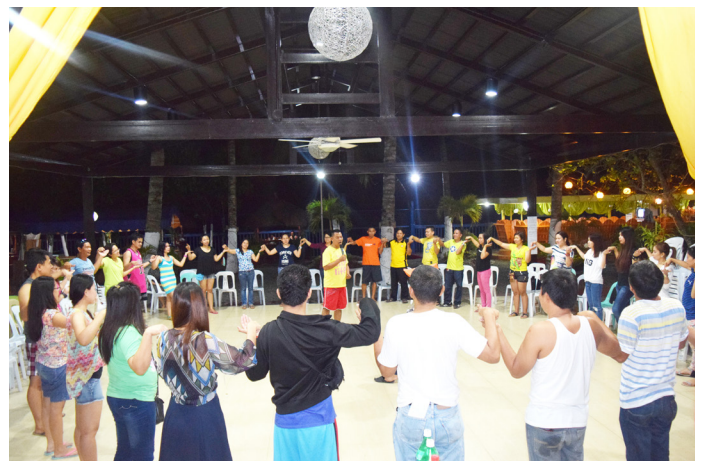
The DILG XII Regional Office personnel recently gathered for a team building activity entitled "Capability Building and Strengthening Organizations Effectiveness through Solidarity and Trust" at Princess Del Leonor Beach Resort, Kiamba, Sarangani