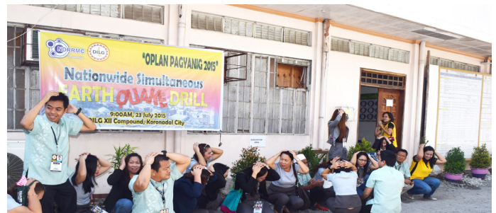
DILG 12 Regional Office personnel apply the duck, cover and hold positions during the 2nd Quarter NSED exercises