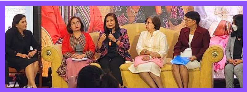
" This practice is something that we are really proud of, as we believe that this has truly contributed to the overall Gender and Development efforts of the Government, "

The Summit was held from June 7-9 at Manila Prince Hotel, City of Manila, and was attended by all RGADCs from all the regions of the country.