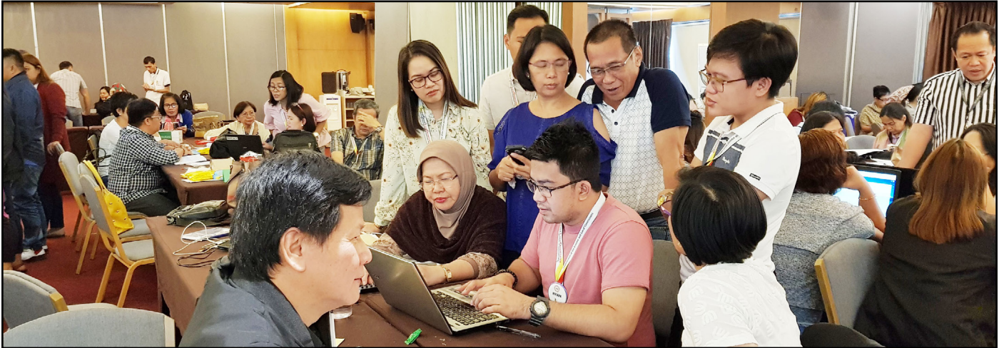
The SGLG Team of Region XII during the SGLG National Orientation spearheaded by BLGS-DILG Central Office

“The SGLG is a game-changer for local government units...”