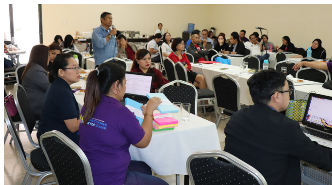
Members of the MANCOM during the presentation of updates from the field offices