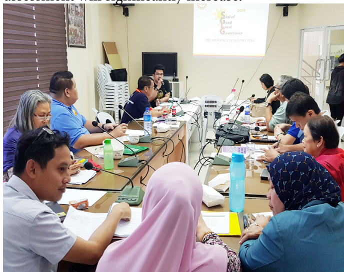
The members of RAT and Sub RAT during the pre implementation meeting