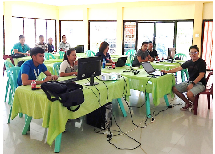
The participants during the presentation of results generated from the CBMS Statsim

The Local Government Unit of Lutayan, Sultan Kudarat conducted their Community-Based Monitoring System-Accelerated Poverty Profiling (CBMS-APP) Module 2: Data Processing and Poverty Mapping last February 11-15, 2019 at the BuB Hall, Municipal Compound of Lutayan after completing the data gathering for their eleven (11) Barangays. The activity was spearheaded by the Municipal Planning Office and was participated in by eighth (8) personnel from the LGU who will be responsible for