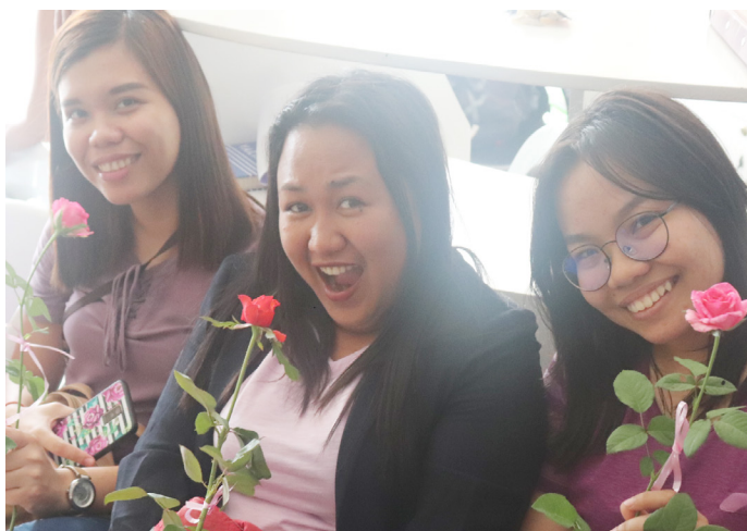
PDMU ladies with all smiles after receiving roses during the women’s day celebration

A tribute activity was conducted on last March 8, 2019 by the Regional Office XII in celebration of the International Women’s Day and Women’s Month with the theme “Make Change Work For Women” and ad campaign #BalanceForBetter.