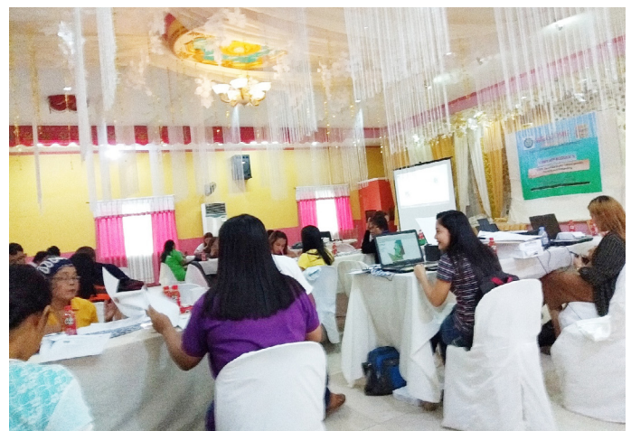
The LGU Kabacan participants during the workshop of the Module 3 BDP using CBMS Data

LGU Kabacan, Cotabato Province successfully conducted their CBMS-APP Module 3: Barangay Planning and Budgeting (BDP) using the CBMS Data last March 18-22, 2019 @ 88th Avenue Convention Center, Kabacan, Cotabato which was participated in by 72 barangay officials and personnel from the 24 Barangays of the Municipality. The final output of the activity is the draft BDP for each Barangay.