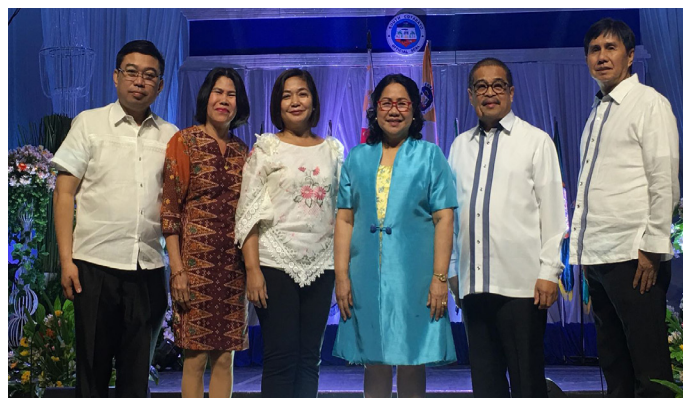
RD Leysa with Gov. Fuentes and other RDs of Region XII

From 2016 to 2018, the CMGP has granted a total of P686.75 million for the construction of more than 58 kilometers of provincial roads all over South Cotabato. For 2019, the Department is set to download P134 million for the construction of six road projects in Tampakan, Koronadal City, Surallah, Polomolok, Tboli, Tantangan and Norala. That would bring the total CMGP funds to P814 million.