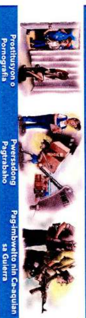
Prostitusyon o Pornograpia